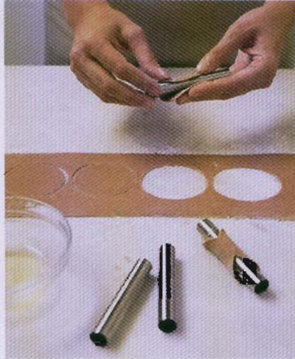
shaping the shells