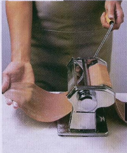
flattening the dough